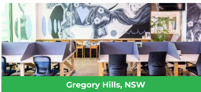
Gregory Hills, NSW

OWNERSHIP: Leased OPENING: April 2026 DESKS: 92